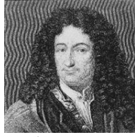
Michel Rolle Mathematician Born: April 21, 1652 Birth Place: Ambert, France Nationality: French Known for Rolle's Theorem