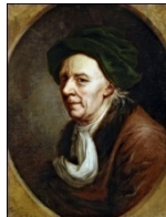
Leonhard Euler Mathematician Born: April 15, 1707 Birth Place: Basel, Switzerland Nationality: Swiss Known as Introducer of Analytic Number Theory