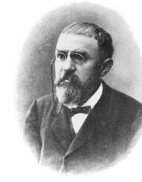
Henri Poincaré Mathematician Born: April 29, 1854 Birth Place: Nancy, France Nationality: French Known for Poincaré conjecture