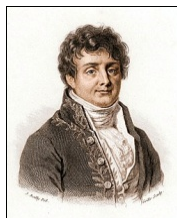
Carl Friedrich Gauss Mathematician Born: April 30, 1777 Birth Place: Brunswick, Germany Nationality: French Known as all time mathematician