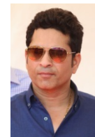
Sachin Ramesh Tendulkar

Known for Concepts of Physics, Winner of Padma Shri in 2020