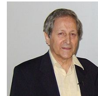
Claude Cohen-Tannoudji Physicist Born: April 1, 1933 Birth Place: Constantine, French Algeria Nationality: French Nobel Prize in Physics in 1997