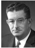
Robert Burns Woodward Organic Chemist Born: April 10, 1917 Birth Place: Boston, Massachusetts, US Nationality: United States Winner of Nobel Prize in Chemistry in 1965