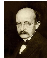
Max Planck Physicist Born: April 23, 1858 Birth Place: Kiel, Duchy of Holstein Nationality: German Nobel Prize in Physics in 1918 for discovery of energy quanta