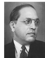
BR Ambedkar Bharat Ratna Born: April 14, 1891 Birth Place: Mhow indore, India Nationality: Indian Known as Chief Architect of Indian Constitution