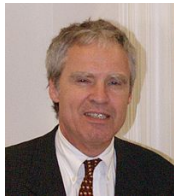
Horst Ludwig Stormer

Known for Proving Taniyama-Shimura conjecture, Abel Prize in 2016