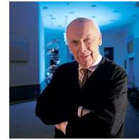
James Dewey Watson Physicist and Mathematician Born: April 6, 1928 Birth Place: Chicago, US Nationality: United States Known for DNA Structure and Molecular Biology, Nobel Prize in 1962