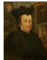
Francesco Maria Grimaldi