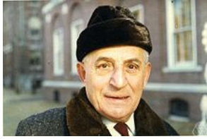
Oscar Zariski Mathematician Born: April 24, 1899 Birth Place: Kobrin, Russia Nationality: American Known for Contributions to algebraic Geometry