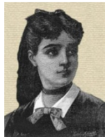
Sophie Germain Mathematician Born: April 1, 1776 Birth Place: Paris, France Nationality: French Famous for her work in number theory and theory of elasticity