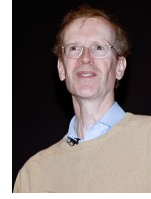
Andrew John Wiles