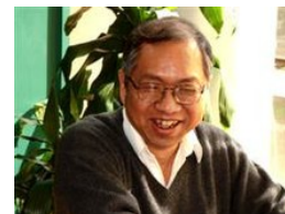
Shing-Tung Yau Mathematician Born: April 4, 1949 Birth Place: Shantou, China Nationality: US Known for Calabi Conjecture, Fields Medal in 1982