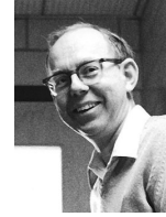
Robert Mills Physicist Born: April 15, 1927 Birth Place: Englewood, New Jersey Nationality: American Known for Yang-Mills Theory