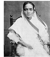
Kasturba Gandhi Social Activist Born: April 11, 1869 Birth Place: Porbandar, India Nationality: Indian Wife of Mahatma Gandhi