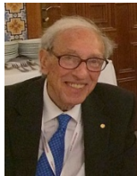
Edmond Henry Fischer Biochemist Born: April 6, 1920 Birth Place: Shanghai, China Nationality: American Known for Phosphorylation, Nobel Prize in Medicine in 1992