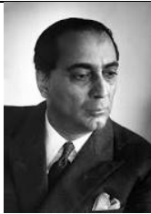
Homi J Bhabha

Born: October 19, 1910 Birth Place: Lahore. Erstwhile India Awards: Nobel Prize for Physics In 1983, Gold Medal of the Royal Astronomical Society