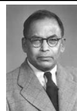
Meghnad N. Saha

QUOTE: Don't take rest after your first victory because if you fail in second, more lips are waiting to say that your first victory was just luck