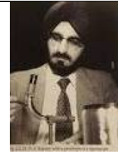
Narinder Singh Kapany

Born: October 30, 1909 Birth Place: Mumbai Awards: Padma Bhushan, Known As: Father of Indian Nuclear Programme