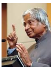
APJ Abdul Kalam

Quote: Where there is love, there is life