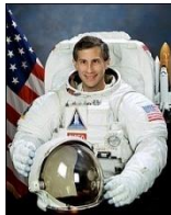
Jerome Apt Astronaut Born: April 28, 1949 Birth Place: Springfield, Massachusetts, US Nationality: American