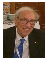
Edmond Henry Fischer Biochemist Born: April 6, 1920 Birth Place: Shanghai, China Nationality: American Known for Phosphorylation, Nobel Prize in Medicine in 1992