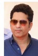
Sachin Ramesh Tendulkar Cricketer Born: April 24, 1973 Birth Place: Bombay, India Nationality: Indian Winner of Padma Vibhushan, Padma Shri, Bharat Ratna