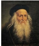
Leonardo da Vinci