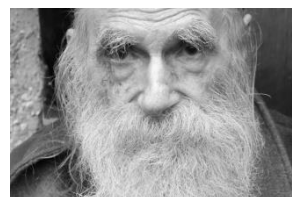
G Spencer Brown Mathematician Born: April 2, 1923 Birth Place: Grimsby, England Nationality: British Famous as Author of the book Laws of Form