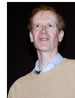
Andrew John Wiles Mathematician Born: April 11, 1953 Birth Place: Cambridge, UK Nationality: British Known for Proving Taniyama-Shimura conjecture, Abel Prize in 2016