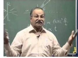
HC Verma Physicist Born: April 8, 1952 Birth Place: Darbhanga, Bihar, India Nationality: Indian Known for Concepts of Physics, Winner of Padma Shri in 2020