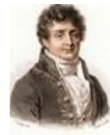
Carl Friedrich Gauss

Known for proving Mohr-Mascheroni theorem