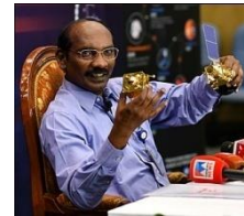
Kailasvadvoo Sivan Chairman, ISRO Born: April 14, 1957 Birth Place: Mela Sarakkalvilai, India Nationality: Indian