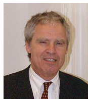
Horst Ludwig Stormer Physicist Born: April 6, 1949 Birth Place: Frankfurt, Germany Nationality: US Nobel Prize in Physics in 1998