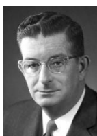
Robert Burns Woodward Organic Chemist Born: April 10, 1917 Birth Place: Boston, Massachusetts, US Nationality: United States Winner of Nobel Prize in Chemistry in 1965