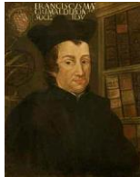
Francesco Maria Grimaldi