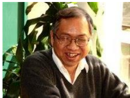
Shing-Tung Yau Mathematician Born: April 4, 1949 Birth Place: Shantou, China Nationality: US Known for Calabi Conjecture, Fields Medal in 1982