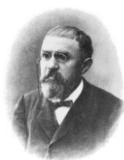
Henri Poincaré Mathematician Born: April 29, 1854 Birth Place: Nancy, France Nationality: French Known for Poincaré conjecture