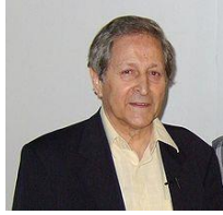
Claude Cohen-Tannoudji Physicist Born: April 1, 1933 Birth Place: Constantine, French Algeria Nationality: French Nobel Prize in Physics in 1997