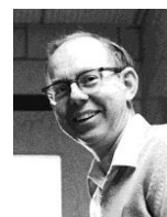
Robert Mills Physicist Born: April 15, 1927 Birth Place: Englewood, New Jersey Nationality: American Known for Yang-Mills Theory