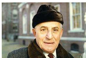
Oscar Zariski Mathematician Born: April 24, 1899 Birth Place: Kobrin, Russia Nationality: American Known for Contributions to algebraic Geometry